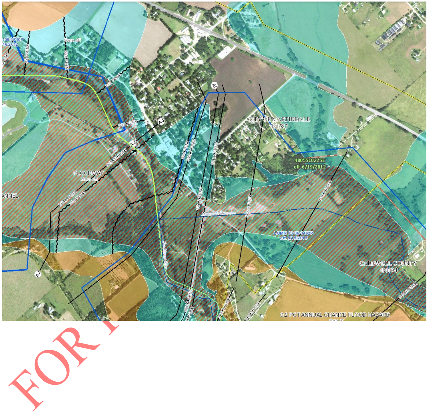
Exhibit A – Caldwell County – Martindale Flood/Floodway Area